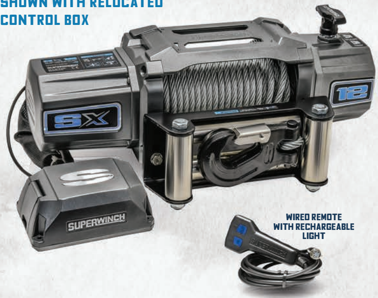
WIRED REMOTE WITH RECHARGEABLE LIGHT